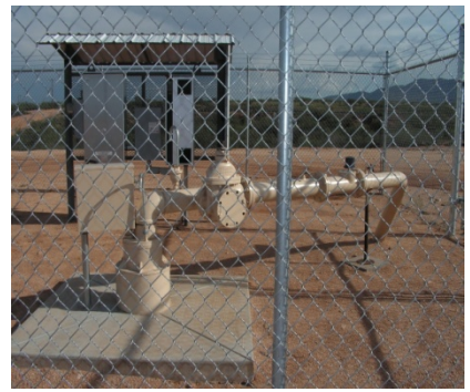
Figure 1: Jannella Well, Benson, AZ

In 2007, the City of Benson pumped approximately 842 acre-ft (af) of water. There are 1794 connections. The average per capita water usage is 150 gallons,. The four